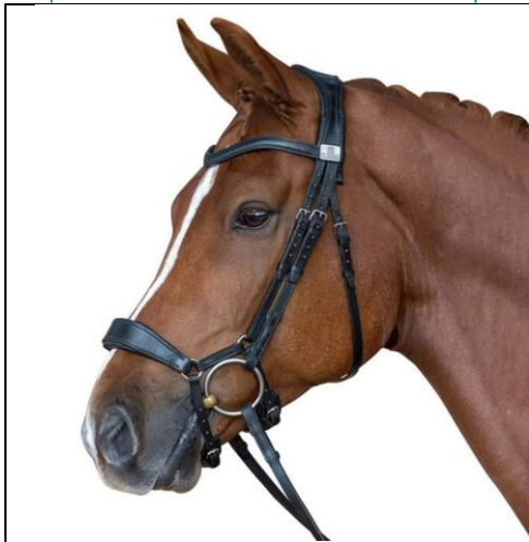
Drop Noseband with Chin & Jaw Strap