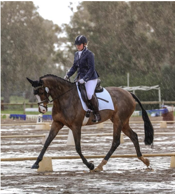
Kellerrains Royal Time at Henty Dressage Championships 2016

Tell us about Kellerrains Vancher and Kellerrains Royal Time.