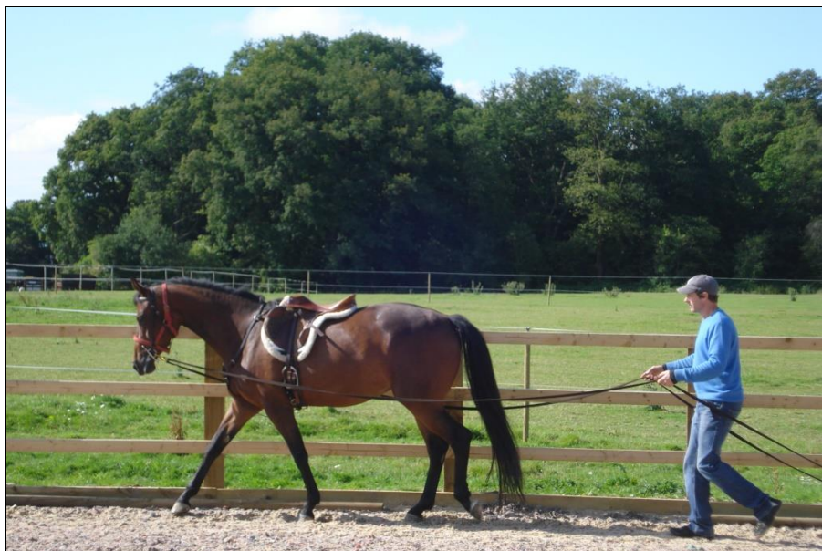
Long Reining is “not permitted” anywhere at an Event