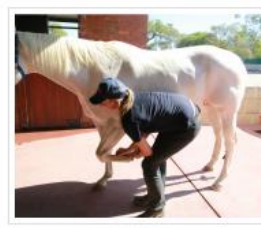
Pre-purchase & Insurance