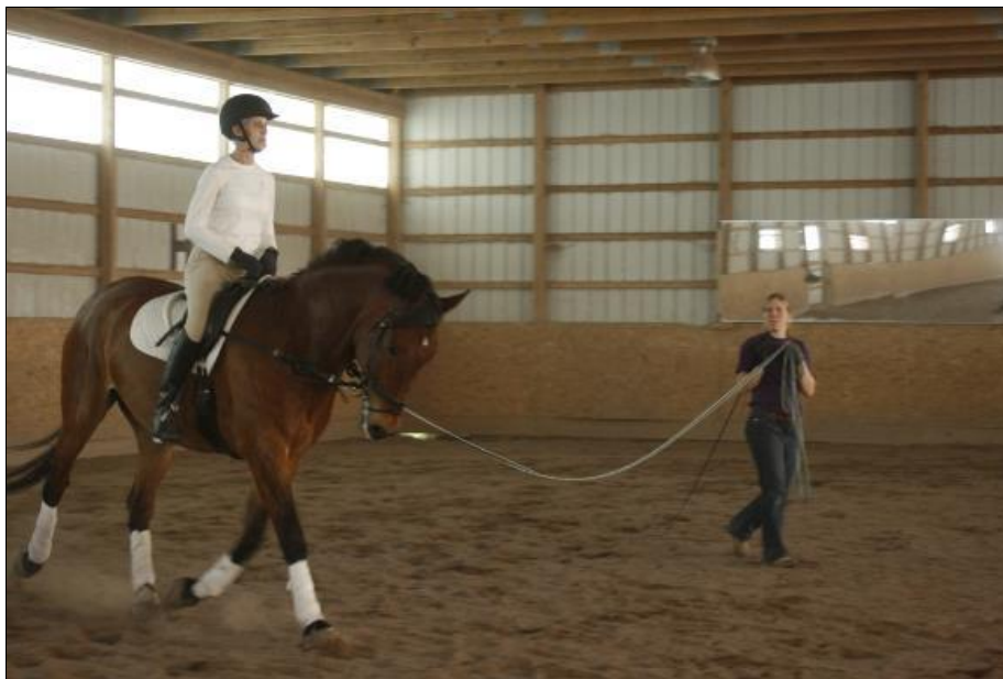
The lunging of a rider mounted in the saddle is “not permitted” anywhere at an Event