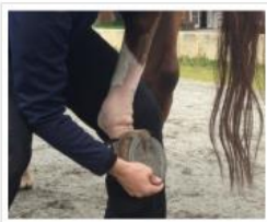
Lameness & Podiatry