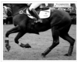
Sport Horse Medicine