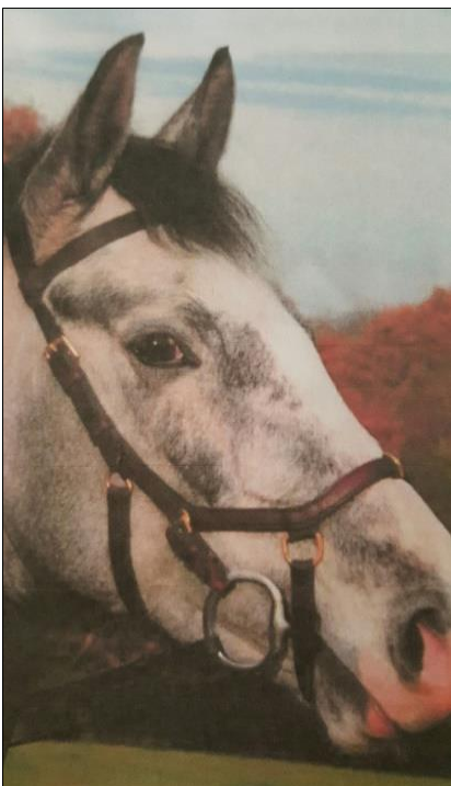
Micklem Bridle – "Permitted"