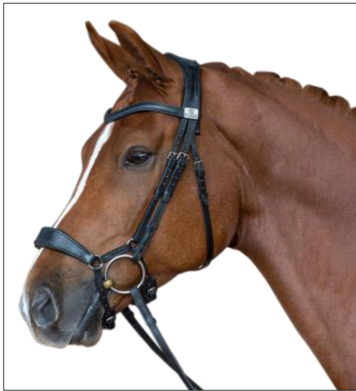
Fairfax Drop with Chin & Jaw Strap – "Permitted"