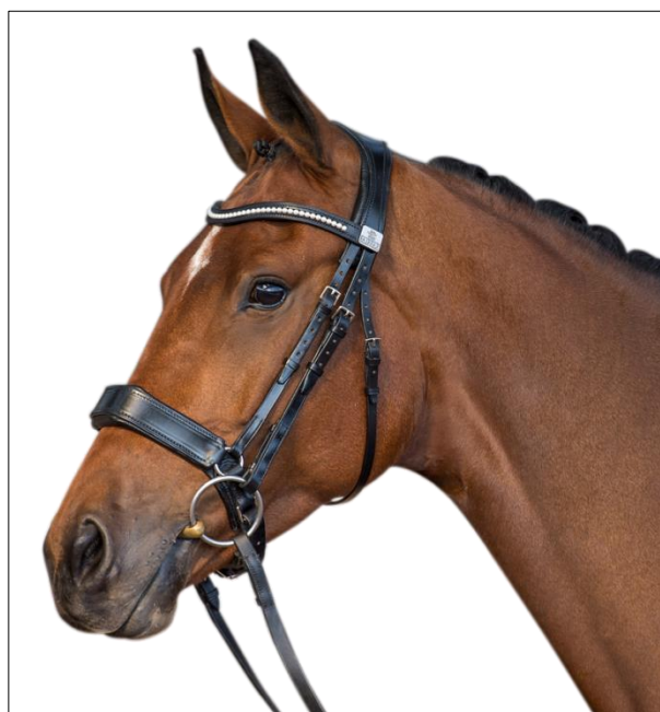
Cavesson Noseband – "Permitted"