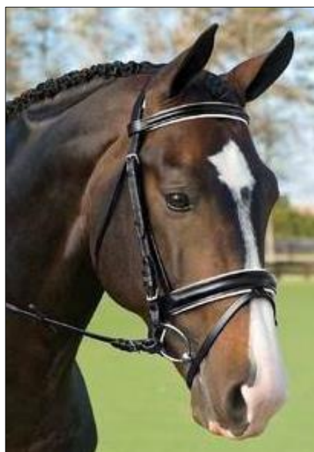
Cavesson with Flash Strap – "Permitted"