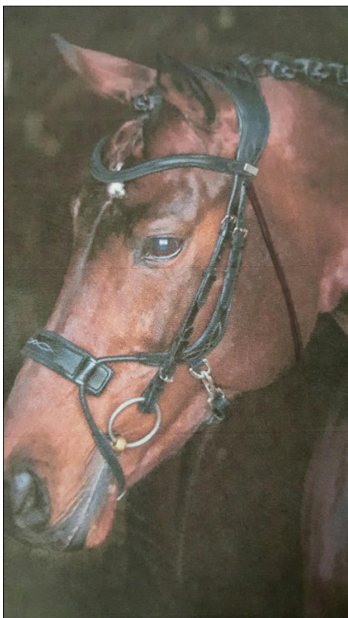
PS of Sweden High Jump Bridle – "Permitted" (must have a throat lash attached)