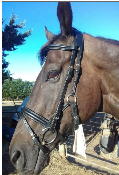
St Zaum Bridle – "Permitted"