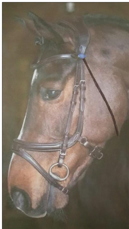
PS of Sweden Jump Off Bridle – "Permitted" (must have a throat lash attached)