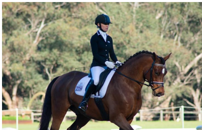
State Championships 2018 - Photos Courtesy of Courtney Reader Artistry