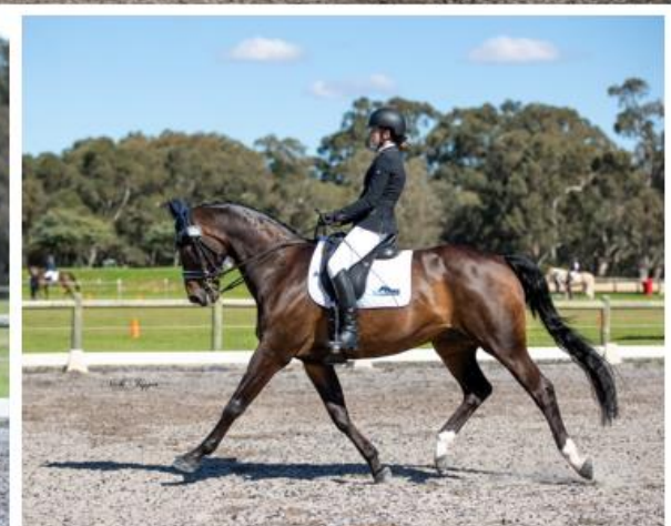
State Championships 2018 - Photos Courtesy of Vicki Tapper