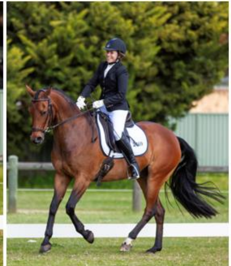
State Championships 2018