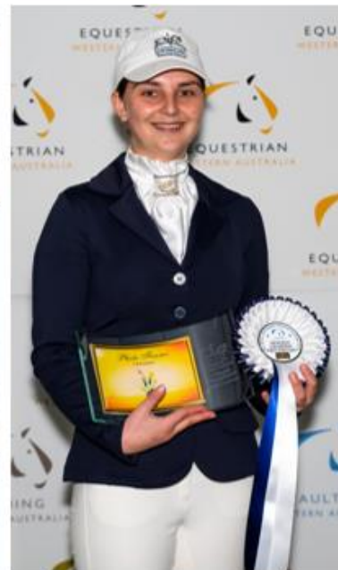
2018 State Championships - Photos supplied by Eric Lloyd Photography