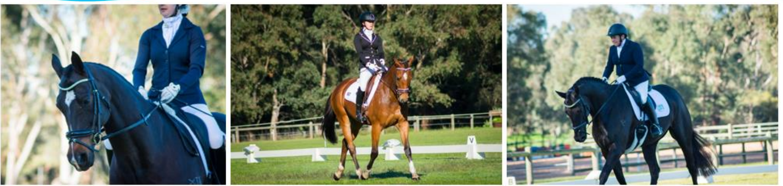
State Championships 2018

Thank you to all of our wonderful sponsors for this year's Championships, your support is invaluable