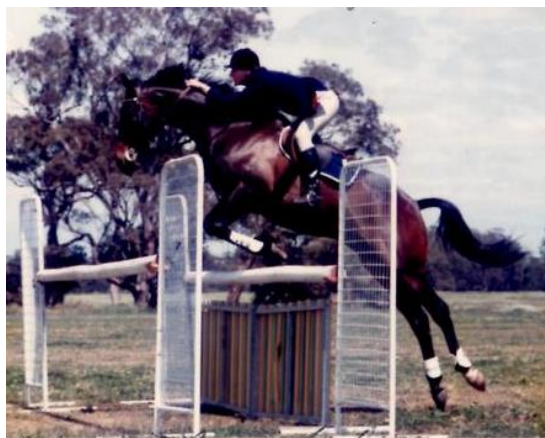
Louie's Legend in our Showjumping Days