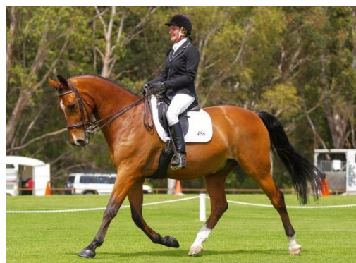
Chesfield Bravo in 2014

Chesfield Bravo (Bravo) is now 22 years old, he's by Barrabadeen Fortune out of Kiss Me Kate . I bought him from his breeder at five years old, my first 'real' warmblood. Although never the dressage mega star he was consistently in the top ten throughout his dressage career and regularly in the top six. His laid back and kind temperament allowed us to learn the higher movements together and progress through to Advanced level, placing 4th at the State Championships. Some of you that may have seen him (or given us a wide berth in the warm-up when he was in fire-breathing dragon mode) may well question my belief in his temperament! I retired him from competition at the end of 2014 and he now happily shows Jessie the ropes out on the roads, supervises our training sessions (I'm sure some days he's laughing) and is keen to show Jessie how easy those flying changes are when he gets in the arena once a fortnight.